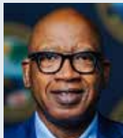
Mayor Ken Welch St. Petersburg